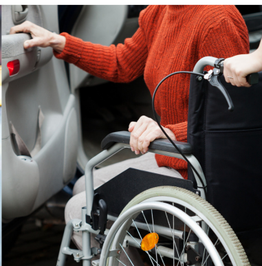
Non-Emergency Medical Transportation